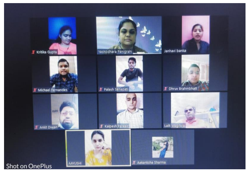
Webinar on art, culture and cuisine of Chhattisgarh and Gujarat (Pic 2)