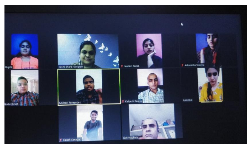
Webinar on art, culture and cuisine of Chhattisgarh and Gujarat (Pic 3)